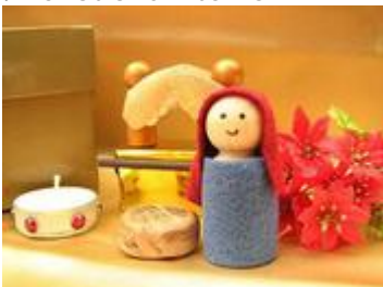
Entrance of the Theotokos Learning Box Kit $9